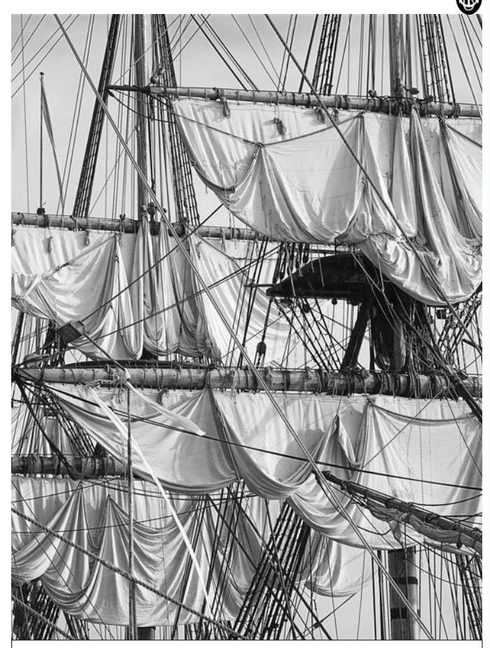
This is a nondescript image of a wall mural, found at <u>https://www.photowall.co.uk/sailing-ship-1-</u>wallpaper

This is the Club's newsletter, as you know, but it is also a vehicle for members to tell us about themselves and their activities in a less formal way than in The Kedge Anchor. But that means you, the reader, are required to provide the stuff for other members to read. Yes, YOU!