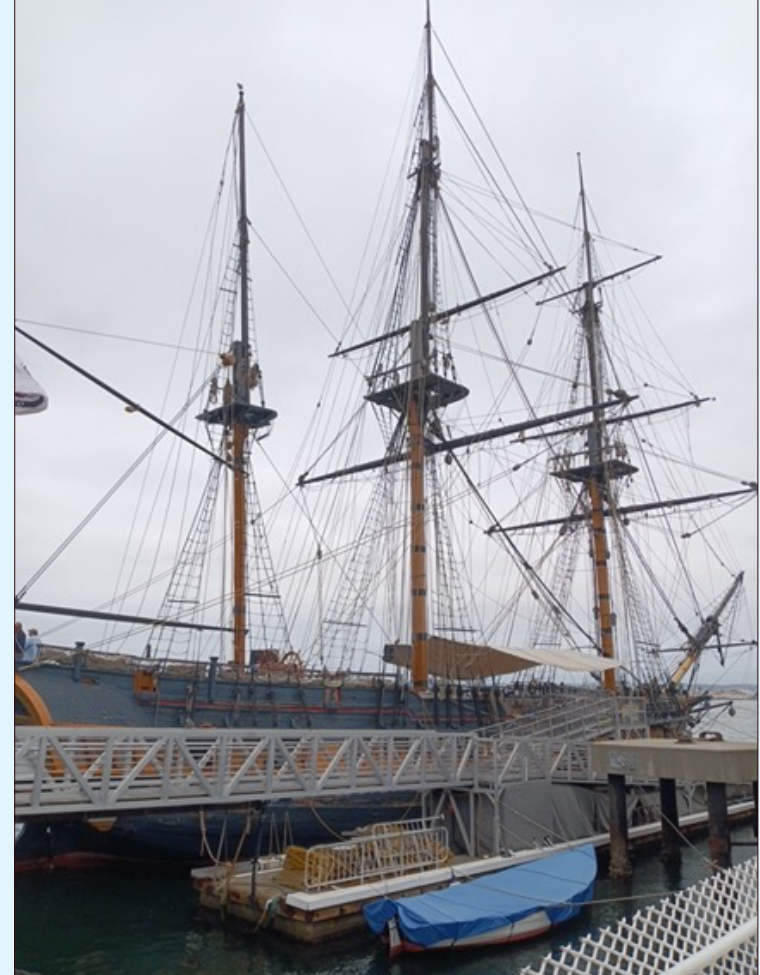
Many of you, especially our California members, are aware that the museum itself is completely afloat. One of the 'exhibits' is a replica of a Royal Navy Sixth Rate Frigate — HMS Surprise (24). (Continued on next page)

conference. As a member of the society, I had the honour to chair one of the panels. The theme for this year's conference is Placing the Pacific in the North American Imagination. To my delight, there are papers whose topics fit within our Club's area of interest — the Georgian Maritime Era.