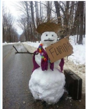
One of our Canadian members sent me this.

These launches have become routine 'happenings' for us here on the Space Coast of Florida. Speaking of happenings, you will certainly see in this edition of The