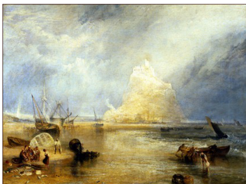
Detail from 'St Michael's Mount'