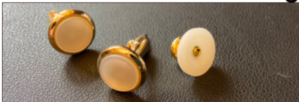
Above: The Rescue Detail